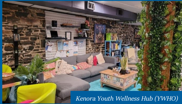
Kenora Youth Wellness Hub (YWHO)