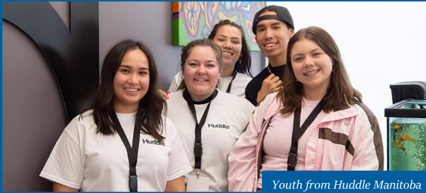
Youth from Huddle Manitoba